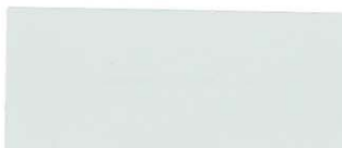
Polar White (80)