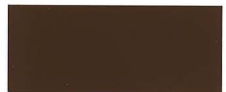
Brown (12)(11 Low SRV, 29ga only) 1