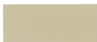
Light Stone (63)