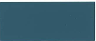
Blue (09)(29ga only)