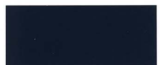
Dark Blue (21)(29ga only)