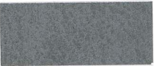
Galvalume ® (41)