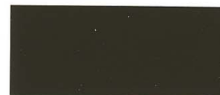
Burnished Slate (49)